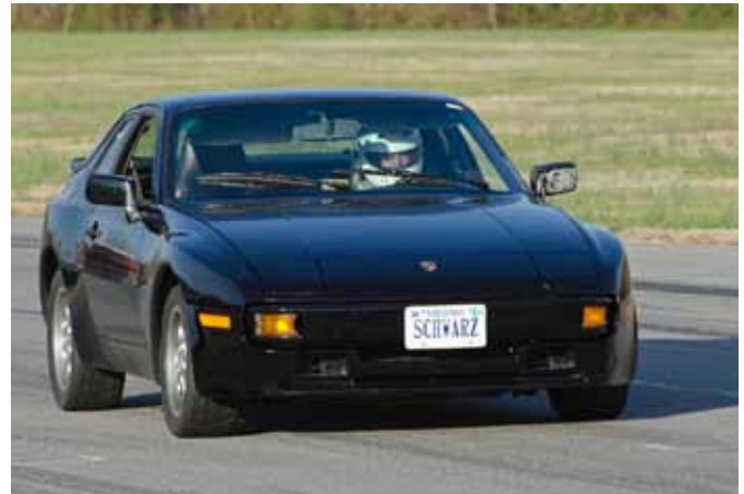
Recycled SCCA racer, Bates McLain