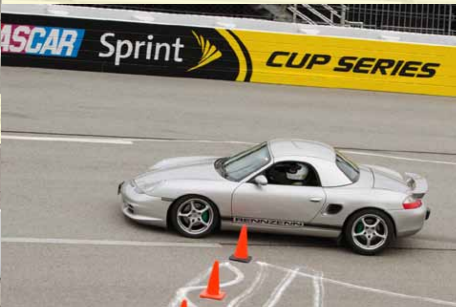
Jeffrey Elmore, second fastest Porsche