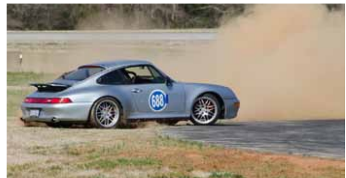
Oil on the track by turn 3!