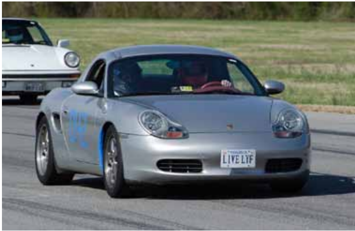
Jim Ottaway on the front straight