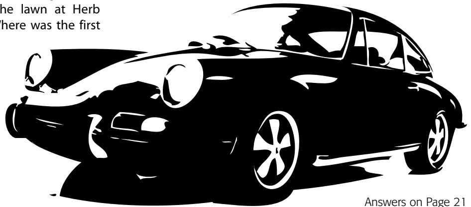
Answers on Page 21

6) Bonus Question: Which Porsche Club member trailered his 1971 Porsche 911T 300 miles to participate in the first RPM Concours event only to find he had left the keys to his car at home and had you hire a local Richmond locksmith to open the car so he could push it off the trailer and into position for the Concours?