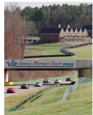
VIR 2011