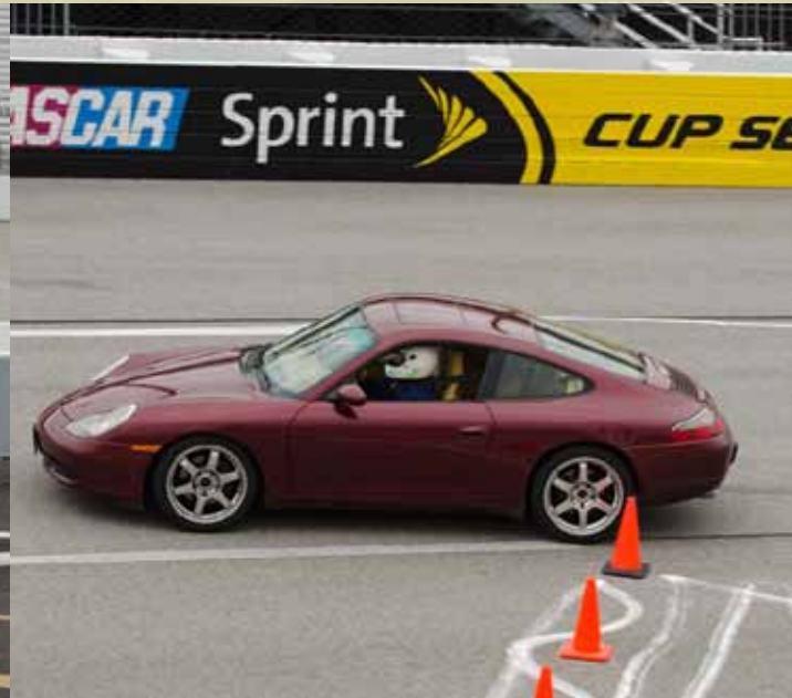
Sherry on track