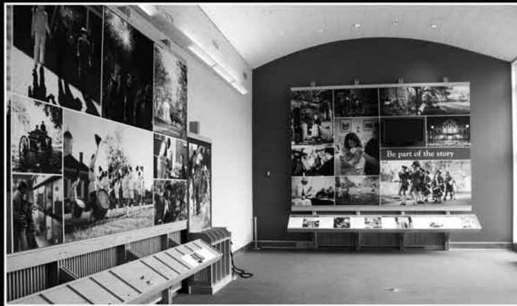
Colonial Williamsburg Multiple Fabric Mural Heavy Knit with FABEZE Frame Application

Bold. Dynamic. Vibrant. You have an idea and a space to fill. We have a variety of ways to bring it to life!