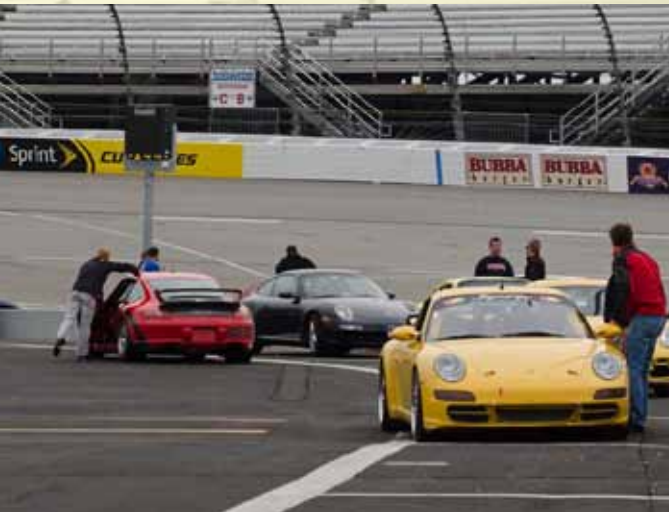
In the infield